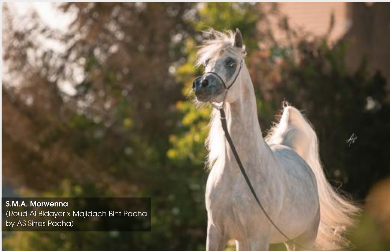
S.M.A. Morwenna (Roud Al Bidayer x Majidach Bint Pacha by AS Sinas Pacha)