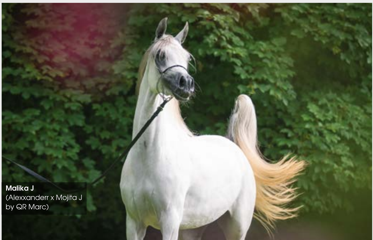
Malika J (Alexxanderr x Mojita J by QR Marc)