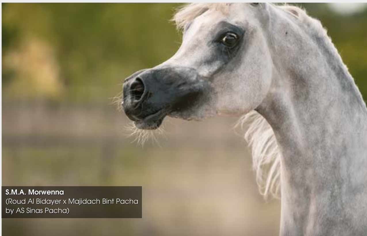
S.M.A. Morwenna (Roud Al Bidayer x Majidach Bint Pacha by AS Sinas Pacha)